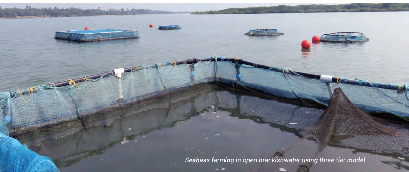
Seabass farming in open brackishwater using three tier model

Farming of seabass to produce fingerlings, advanced fingerlings and harvest size in three different rearing systems of nursery, pre-grow out and grow-out