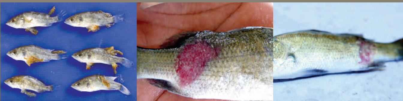
Occasionally, young seabass will get infested with external parasites and microbial pathogen