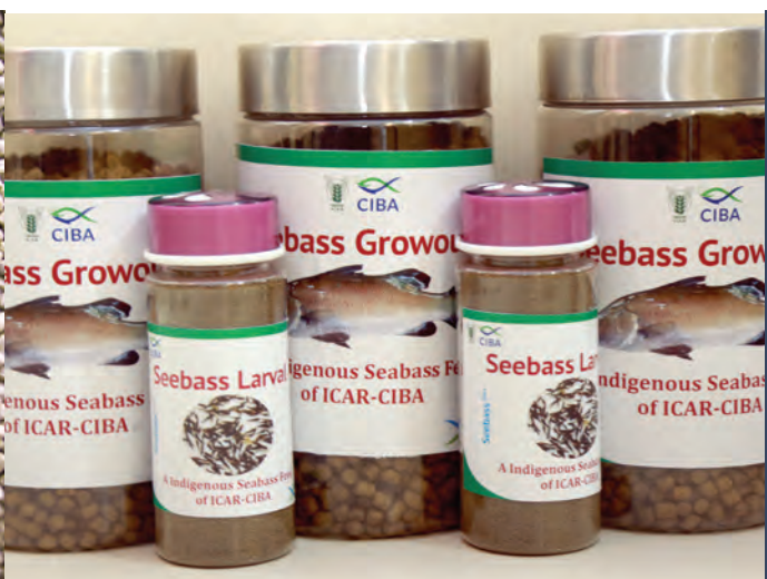
Cost –effective formulated feeds for different life stages of seabass