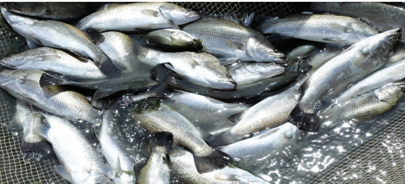
Seabass from pre-grow out system

Seabass can be farmed in ponds and cages. In the pond system, seabass advanced fingerlings can be stocked @ 4,000-5,000 nos/ha to get the production around 4.0 tons/ha. Seabass can be farmed both in freshwater and brackishwater ponds. The preferred pond size can be 0.5 to 1.0 ha. The size can be either rectangular or circular and the dimension can be decided based on the production plan. Seabass advanced fingerlings can be stocked @ 25-30 nos/m 2 in the cage culture system and the productivity can be @ 20-25/nos/m 2 . Recently, farming of seabass in land-based tanks with RAS facility has been gaining popularity, where the productivity can be increased. For cage culture in open water, parameters such as water depth, water flow rate, etc., need to be considered by selecting the site.