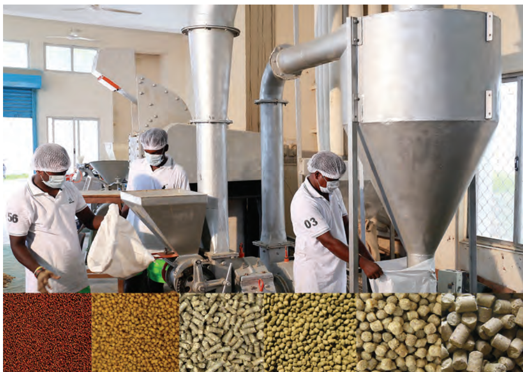
Pilot scale feed mill at Muttukadu Experimental Station of CIBA

Quality feed must be provided in right quantity to get maximum growth and to reduce the feed wastage besides reducing the cost of production. The size of feed particle should be suitable for mouth of fish and they should be trained to take feeds at certain time daily. Feed ration is calculated based on body size. The percent quantity of feed required is higher at the initial stages and as the fish grows, it decreases. But the absolute quantity of feed offered increases as