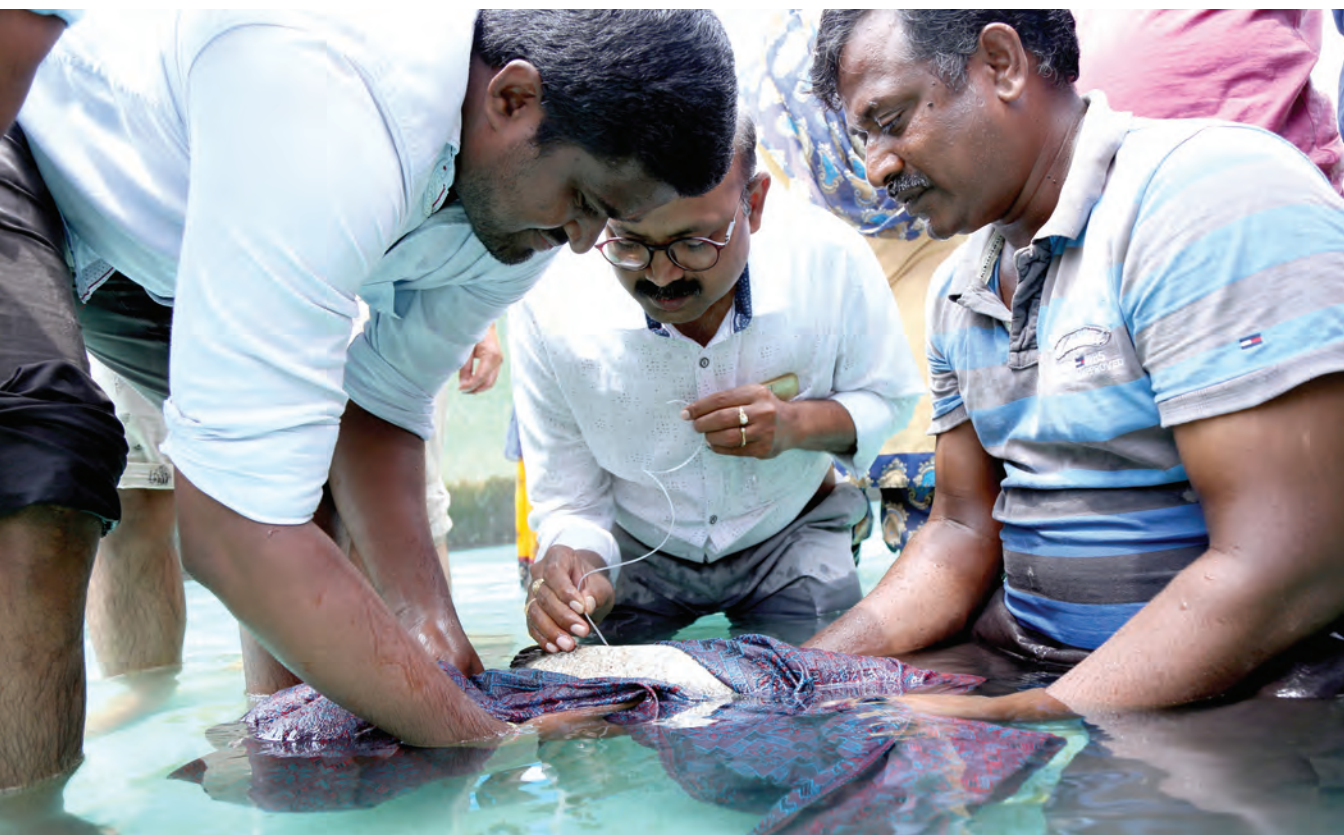
Analysis of maturation stage in captive broodstock maintained in CIBA fish hatchery

There is no sexual dimorphism in seabass. However, small size fishes with a size range from (2-3.5kg) can be males which can be confirmed by observing oozing milt when gentle pressure is applied on the abdomen. In the case of matured females, the fish can be noticed with an enlarged V- shaped belly and genital opening can be seen.