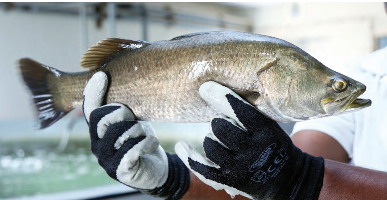
Asian seabass broodstock (male)

India, seabass is being farmed by stocking hatchery produced seed and also seed sourced from the wild.