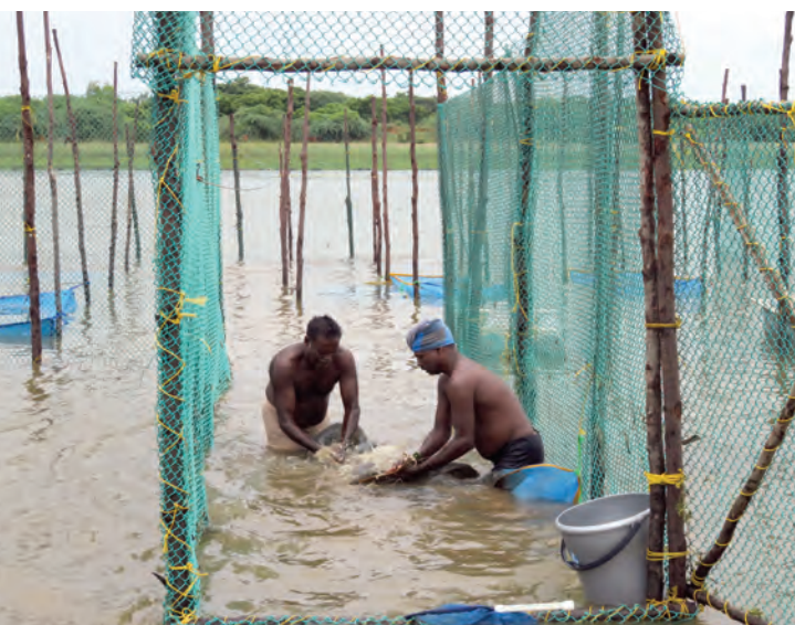
Routine cleaning of hapas

out to keep uniform-size juveniles together and facilitate maximum survival. Grading of fish seed at every 3-4 days interval at the beginning and later for every 10-15 days should be done manually. While grading, hapas should be cleaned to ensure removal of debris attached to the hapas for free flow of water to keep good water quality and oxygen level. The fry will reach a fingerling size of 7.5 – 10 cm long in 60-75 days with 65-75% survival.