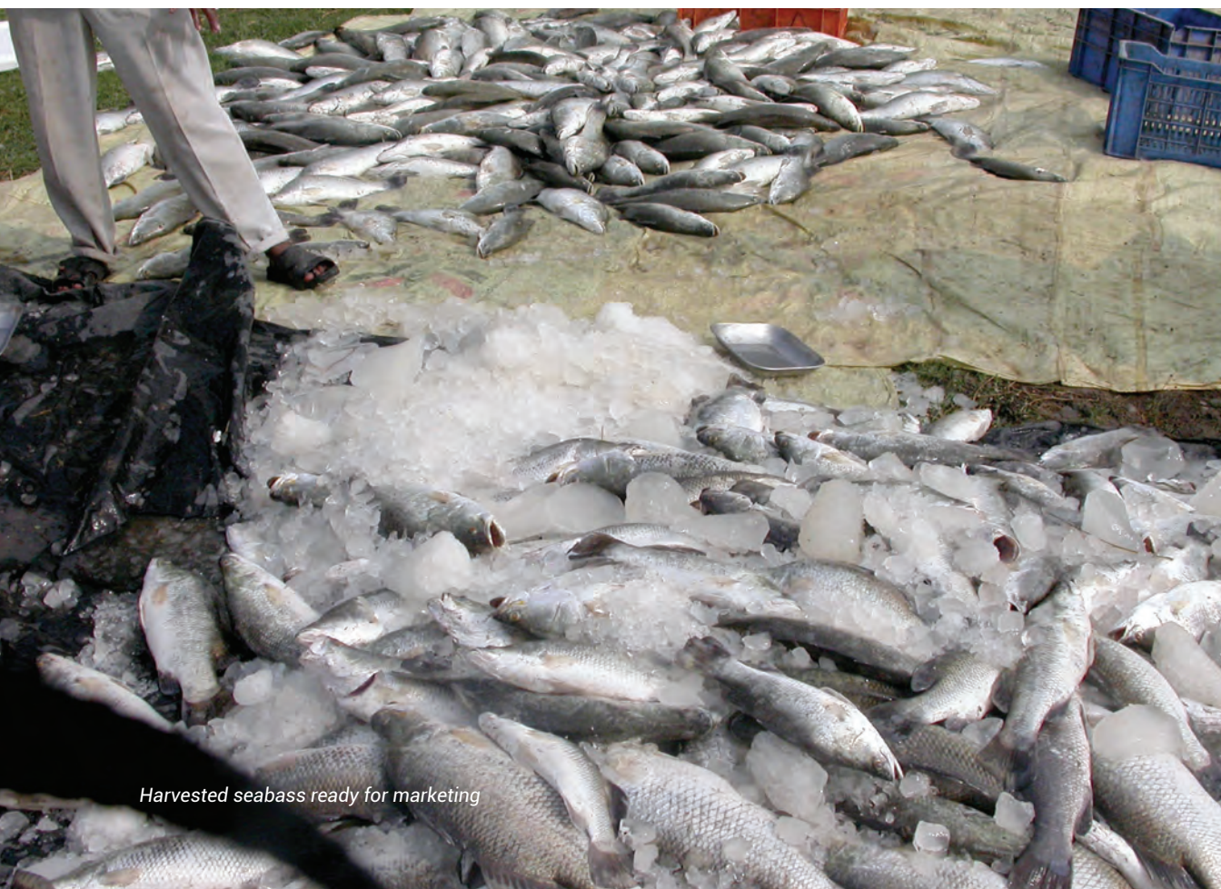
Harvested seabass ready for marketing

The farmer has to finalise the selling price with the traders who will purchase the harvested fish before harvesting. Harvest net, manpower to operate the net, pumping facilities to drain out the pond water, required quantity of ice, weighing balance, baskets to carry the harvested fish from pond site to processing yard have to be arranged. If partial harvest is planned, the harvest can be done as