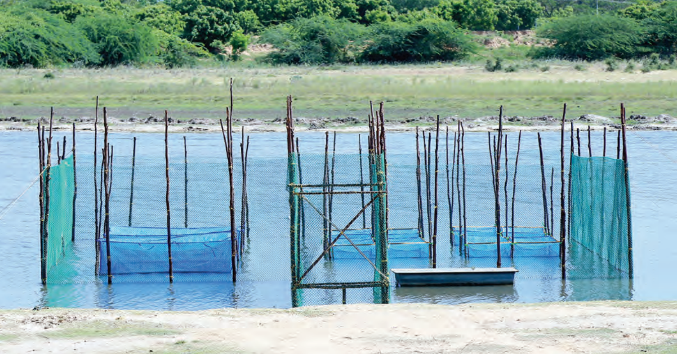
Seabass nursery system in open brackishwater