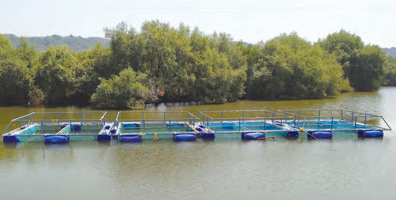
Customized cost-effective cages fabricated using steel frames and plastic barrels