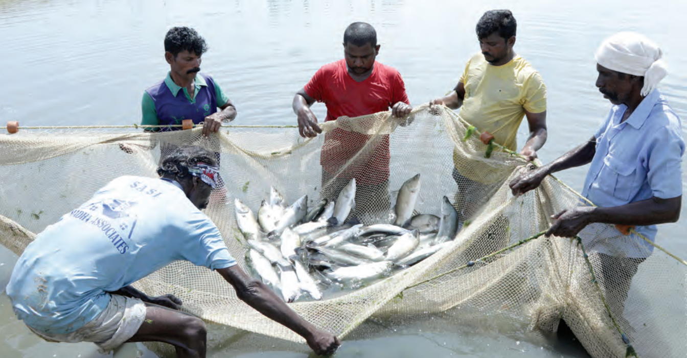
Seabass farmed in brackishwater pond in a short grow-out farming cycle as option for crop rotation in shrimp farming