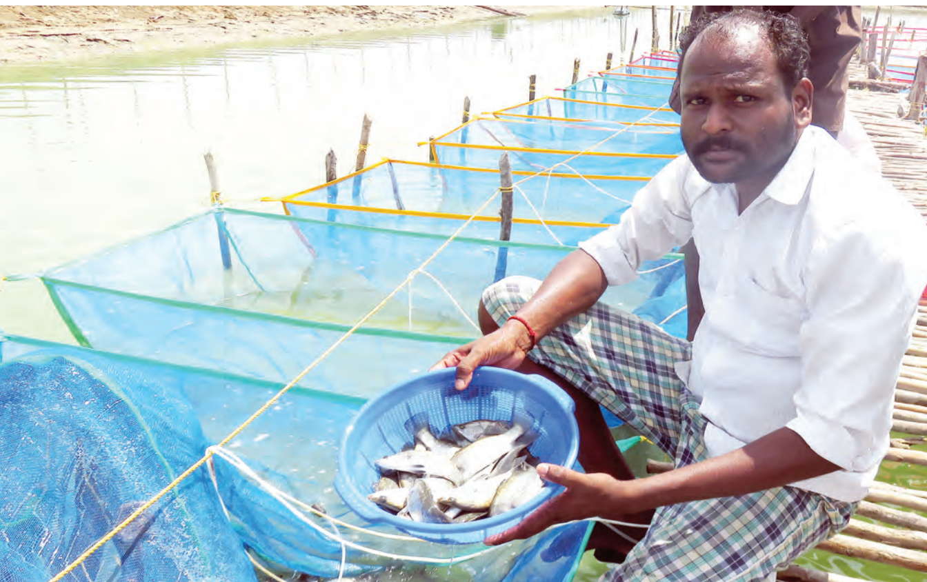
Organised seabass nursery rearing in pond based system

The juvenile fish (80-100 g) stocked will grow into the average size of 1 kg in 6-8 months. They can also be reared further for another 4-5 months to get a size of 2 kg which can fetch premium price in market.