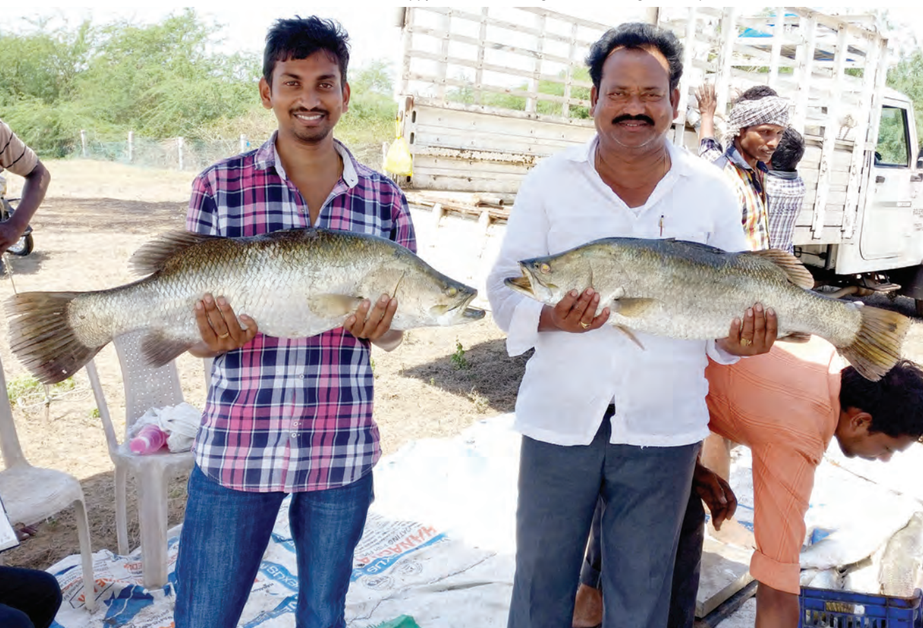
Happy farmers with large seabass targeted for premium markets