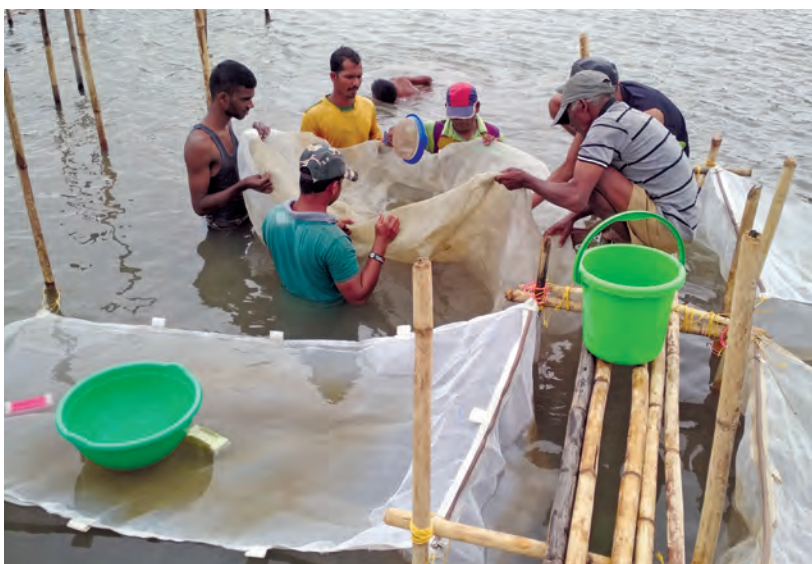
Grading of seabass fry in nursery rearing

Coastal fishers can practice seabass nursery rearing in net hapas fixed in open water bodies or in ponds. Hapas can be fabricated using nylon or High Density Polyethylene net material of sizes such as 2mx1mx1m or 2mx2mx1m and can be fixed in water top layer at a required depth (1.0 to 1.5 m). Hatchery produced seeds of 1.5 to 2.0 cm size can be stocked in hapas @ 500 - 750 nos/ m 2 . The fry can be fed with specially prepared nursery feed at 8-12% of the biomass/day split into 3-4 rations. Due to the cannibalistic behavior like larger fish feeding upon the small ones, grading at frequent intervals (weekly twice) is to be carried