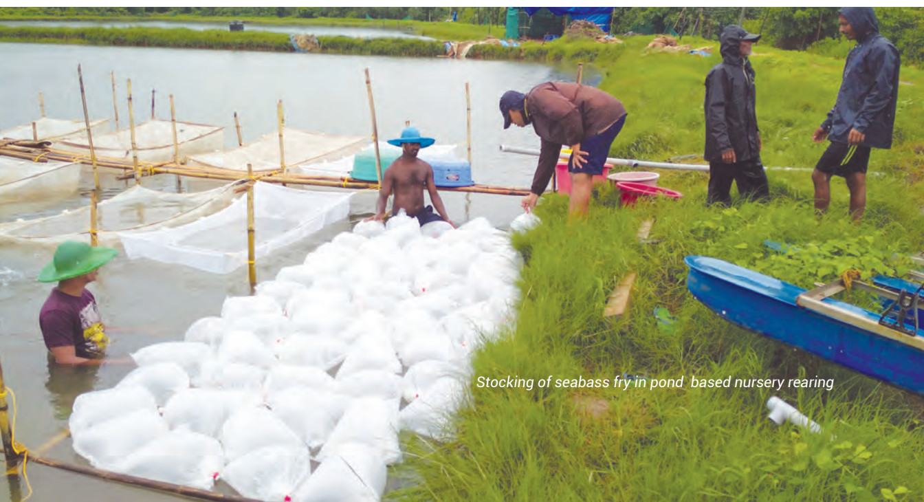
Stocking of seabass fry in pond based nursery rearing

Seabass nursery rearing can be done in three different systems. Seabass fry can be reared in small size ponds, hapas and tanks. Nursery pond size can be 200-500 m 2 area which can be maintained with a water depth of about 75 cm-1.0 m. The hapa, with the size of 2-4 m 2 with a mesh size of 1.5 - 3 mm can be used with 1 m depth. Nursery rearing tanks can be of 5 to 10 ton capacity.