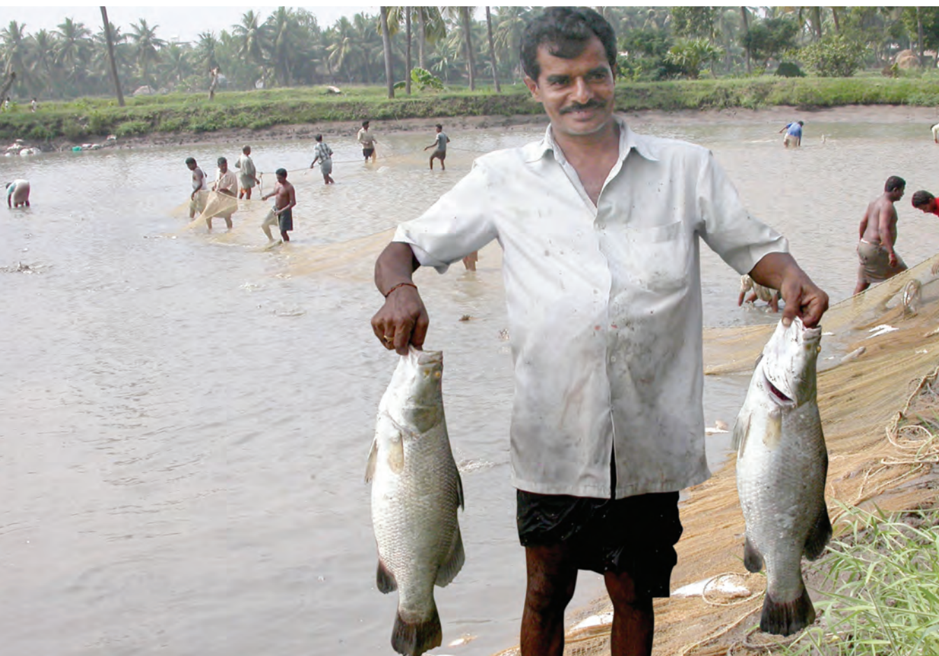
Seabass, a fish highly suitable for farming in freshwater and integration with agriculture

Seabass that are harvested 1.0 kg and above can fetch better price, since it is the most preferred size by the consumers in domestic market.