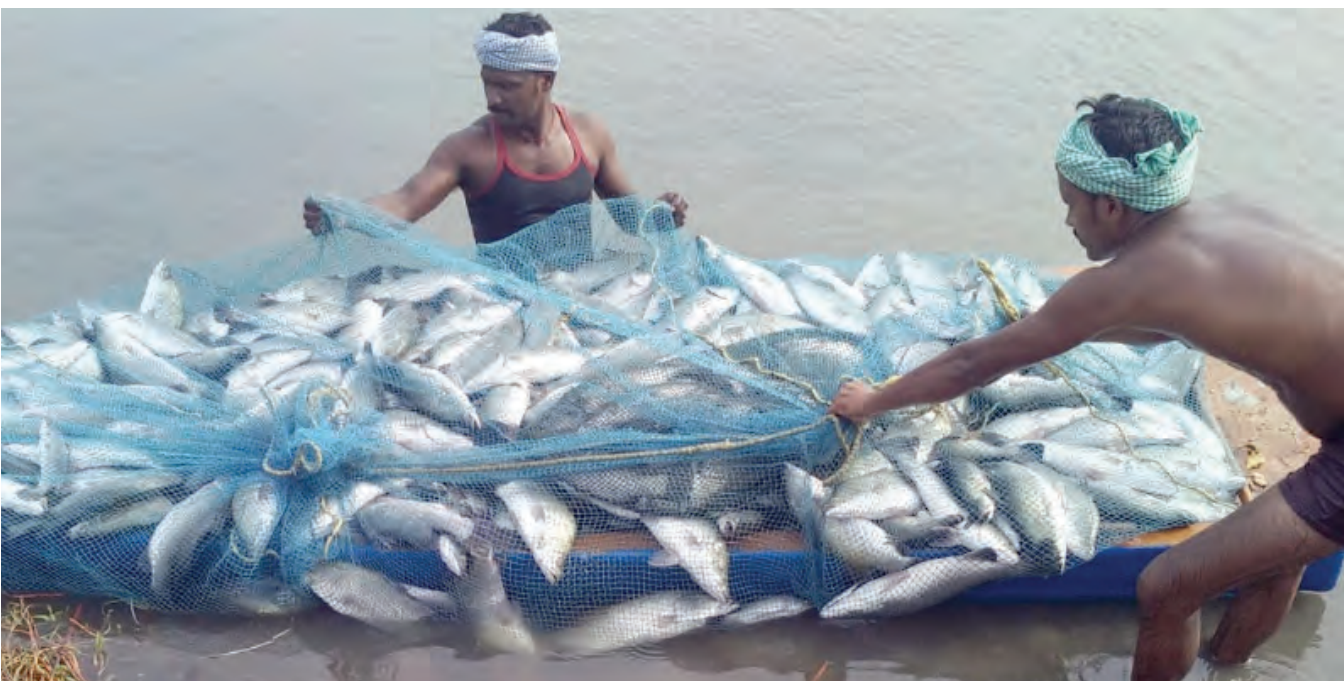
Farmed seabass harvested from pond

and makes the species in wide range culture environments from freshwaters to seawater. It can be farmed in ponds and cages from freshwater to seawater environments. The fish can grow to 1.0 kg size in 6-8 months by consuming pellet feed. Availability of hatchery produced seed and formulated pellet feed ensures the year-round supply and thus enables easy adoption of seabass farming by farmers. It can also be farmed in net cages, floating cages and Recirculatory Aquaculture System (RAS).