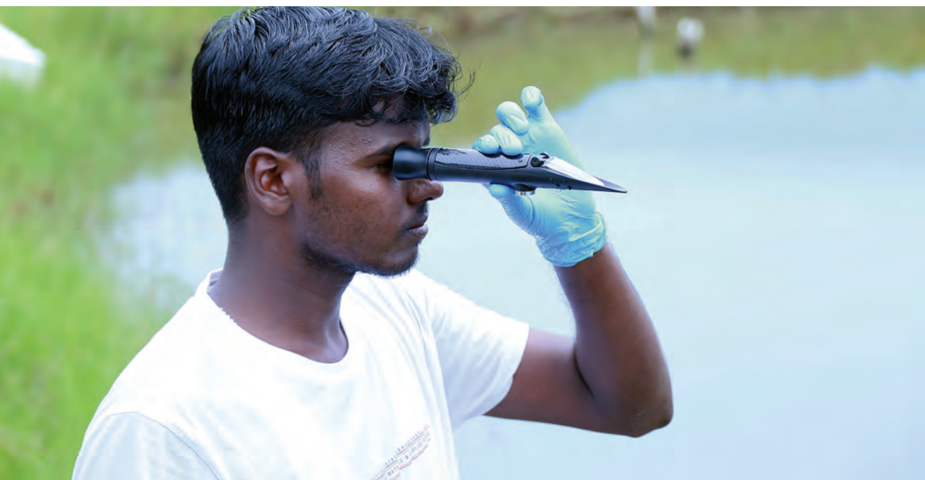
Regular monitoring of water parameters using kits