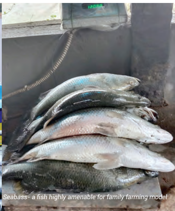
Seabass- a fish highly amenable for family farming model