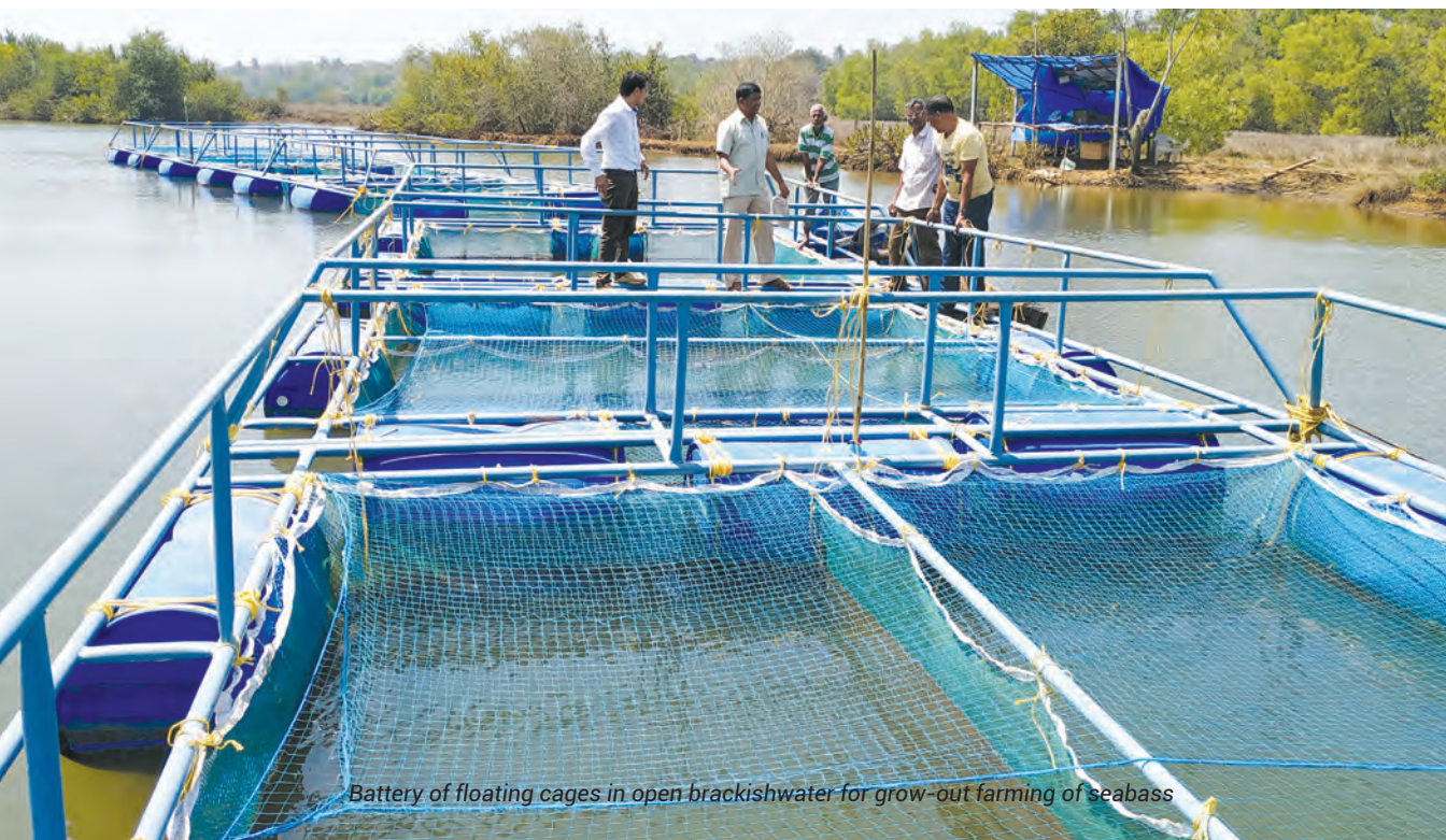
Battery of floating cages in open brackishwater for grow-out farming of seabass

In traditional methods, low-value fishes can be given as feed to seabass. However, such a feeding method may not be possible always as low-value fishes may not be available everywhere throughout the year. Besides the cost of low value fishes will be fluctuating and may not be available in adequate quantity which can affect the farming practice. ICAR-CIBA has developed a range of formulated feeds (Seebass Plus ) for different life stages specific to different rearing systems, such as ponds, RAS and open-water cages. Since, seabass require high protein energy rich feeds. To address this issue, ICAR-CIBA's Seebass Plus has been widely demonstrated in different farming systems, with a FCR of 1.5-1.6. In the improved farming method, scientific