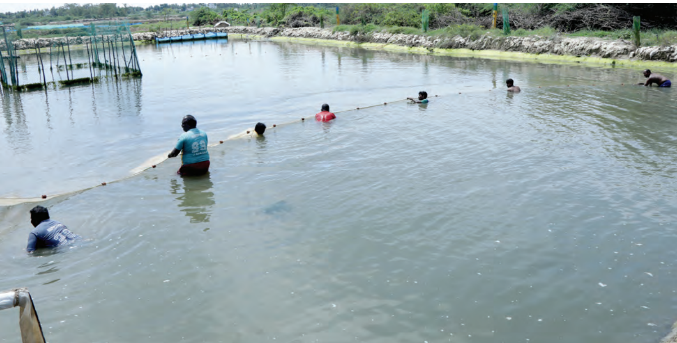
Harvest of seabass from brackishwater ponds using drag net

It is important to harvest seabass from culture ponds without any injury so that they can be sold in good condition. Drag nets can be used for harvesting the farm-grown seabass. Early morning will be the appropriate time for harvest. Before harvest, water level in the pond must be reduced to one foot and then the fish should be caught with a dragnet. Cast net can also be used to catch the fish from ponds at later stage when pond water depth is very low. Finally, fish that are found at pond bottom can be hand-picked to ensure that all fishes are harvested.