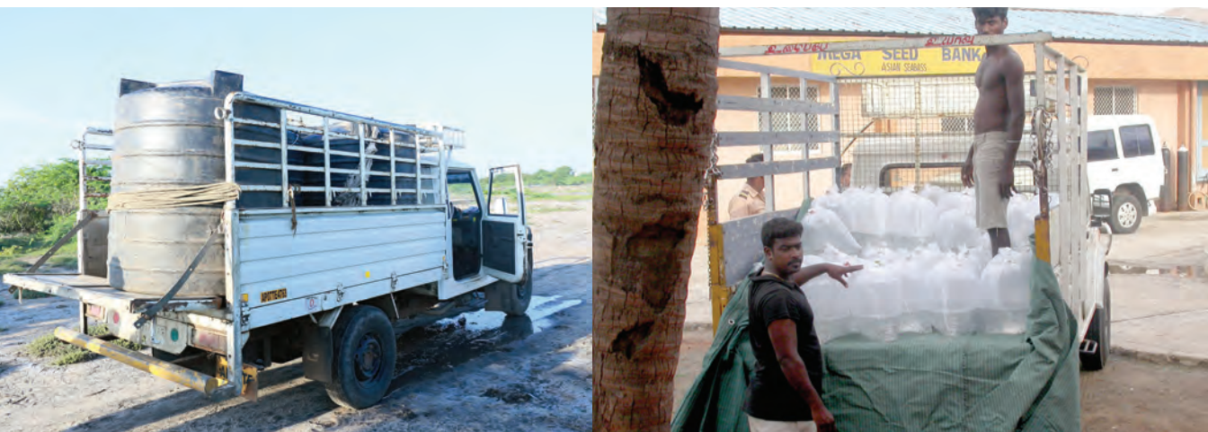
Live transportation of seabass seeds