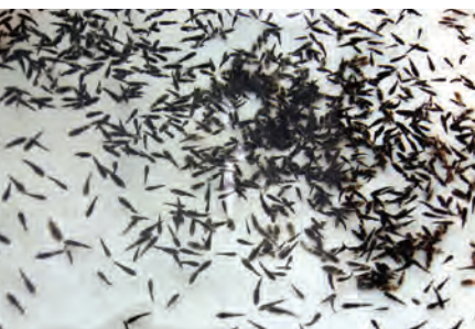
Seabass fry (18 days old)