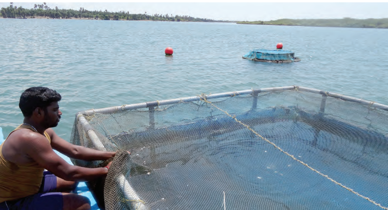
Timely feeding and its management are crucial for a successful harvest

CIBA's Seebass Plus feed can be used in all the stages of cage farming. The feeding rate is 6-4% of body weight in pre-grow out stage and 4-2% in grow-out stages on an average the FCR in pre and grow out stages are 1.5%. The daily ration is equally distributed in two feedings preferably in the morning and evening hours.