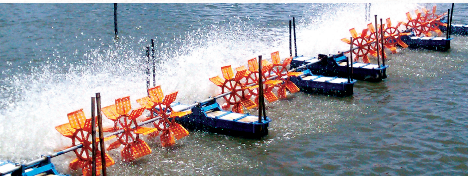
Shrimp Farming at Kakdwip Research Center, West Bengal